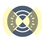
2Q – 180