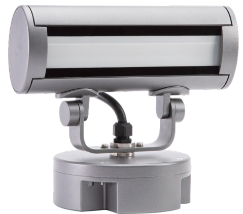
1051: Surface Box Mounted