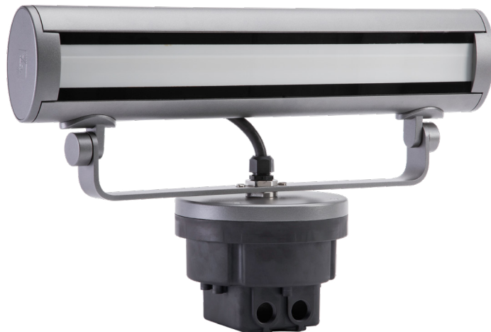
1052: Ground Box Mounted