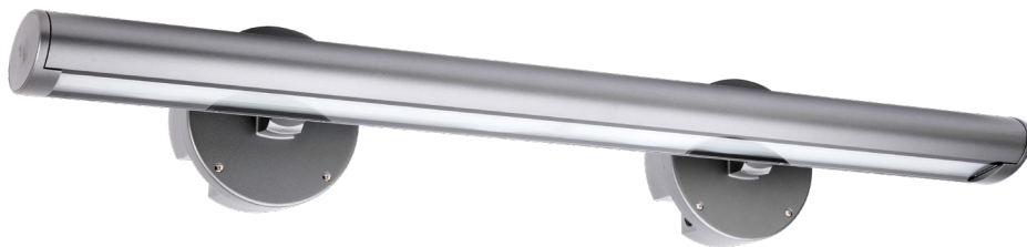
1054: Wall Mounted

The SPECTRA by Vista™ 1051, 1052 and 1054 RGBW outdoor linear floodlights redefine what's possible in dynamic exterior lighting. Now featuring advanced RGBW color and tunable white light technology, the 1050 Linear Series delivers immersive color performance without sacrificing superior white light output. Designed with DMX512 control capability, the series ensures precise color tuning and seamless integration into professional lighting systems. With precision optics, rugged construction, simplified installation through integrated junction box wiring and flexible mounting formats, this series is ideal for sign lighting, architectural wall washing, grazing, and other uniform linear lighting applications. The 1050 RGBW Series provides rich, vibrant illumination and trusted performance with even greater flexibility and ease of use.