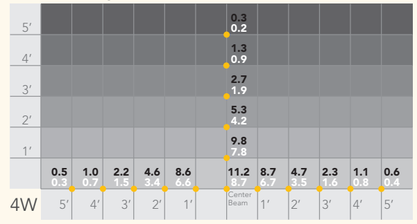
5106 4W Integrated LED