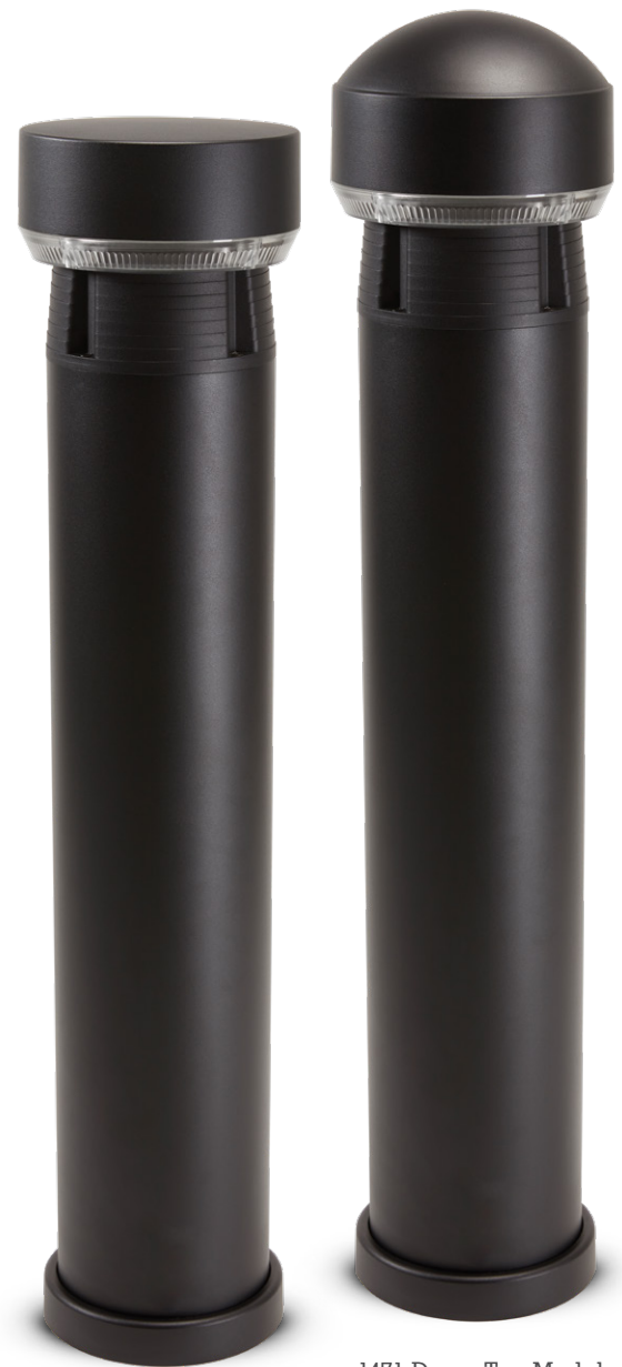
1470 Pill Top Model