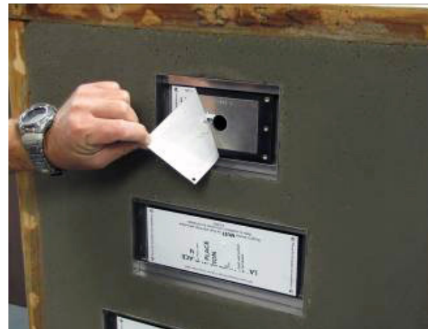
STEP 4 - Remove temporary cover plate label.

Vista Professional Outdoor Lighting reserves the right to modify the design and/or construction of the fixture shown without further notification.