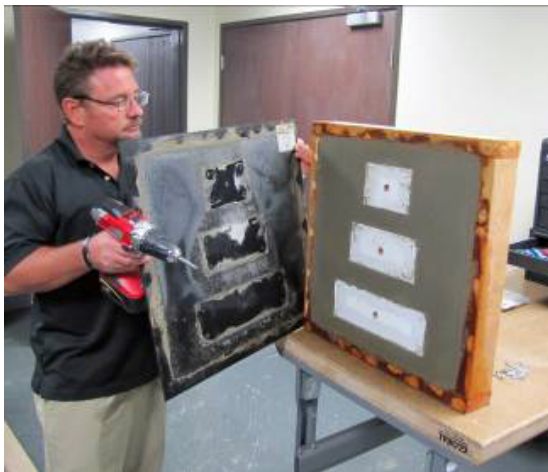
STEP 2 - Once concrete is dry, remove form.