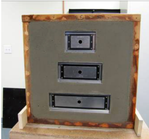
Flush trays shown with temporary cover labels removed.