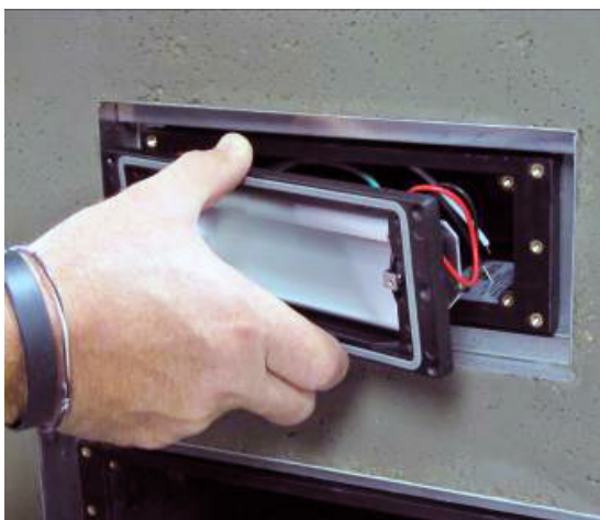
STEP 7 - Install Performance Optic Package (PoP).