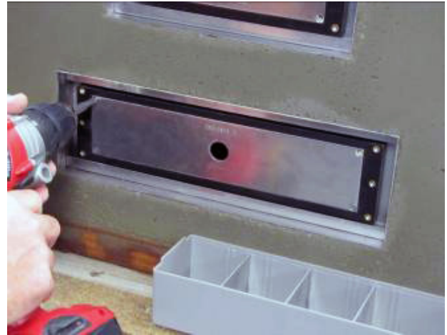
STEP 5 - Remove internal support plate.