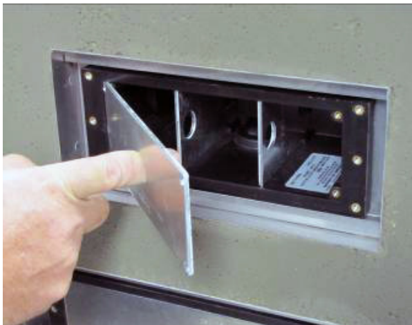
STEP 5 - Remove internal support plate - 2nd photo.