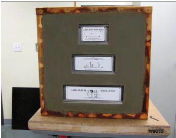
Flush trays shown with pour support plates removed.