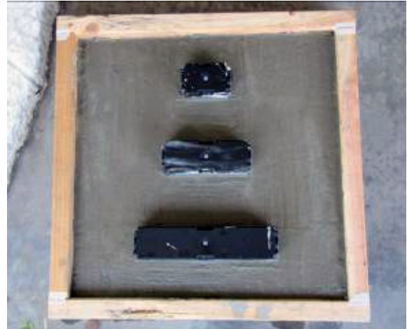
STEP 1 - Pour the RIS into concrete wall, making front surface of tray flush with form.