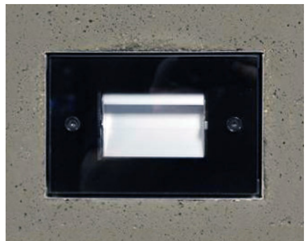
STEP 8 - Install Glass Border door assembly (GaS).

Vista Professional Outdoor Lighting reserves the right to modify the design and/or construction of the fixture shown without further notification.