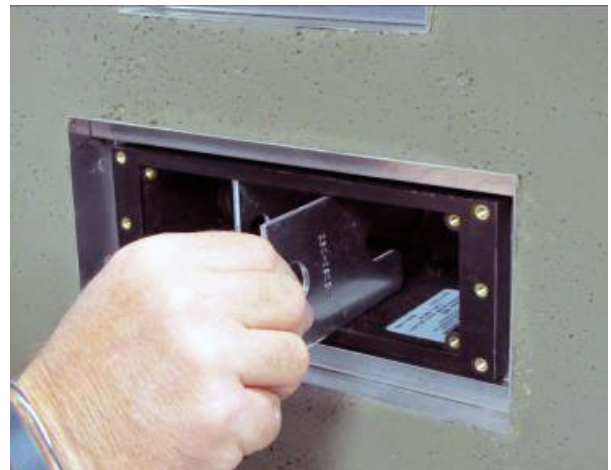
STEP 6 - Remove vertical pour support plate.