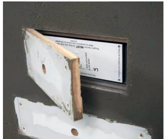
STEP 3 - Remove MDF pour support plate.